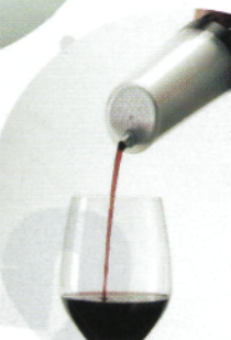
Ravi — the instant wine chiller that launched in Quebec last December