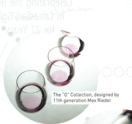
The "O" Collection, designed by 11th generation Max Riedel