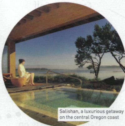
Salishan, a luxurious getaway on the central Oregon coast

Oregon is another destination where our strong dollar can get you better wine and travel. Salishan, a luxurious getaway on the central Oregon coast, combines all the things a woman golfer loves: a Scottish-style links golf course (redesigned by Peter Jacobsen in 2004), fine dining in five restaurants, deluxe rooms with great ocean views, a full service spa and the piece de resistance, a 10,000-bottle wine cellar. Call 1-800-452-2300 or visit www.salishanspa.com . ●