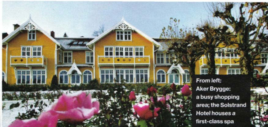
From left: Aker Brygge: a busy shopping area; the Solstrand Hotel houses a first-class spa

The Grand Hotel has a special “ladies’ floor,” with rooms designed by some of Norway’s female celebrities. Admire the ivory palette in Olympic skier Kari Traa’s lovely Snowprincess room, with girly touches like furry duvets, pink pillows and a sheer decorative panel printed with a pen-and-ink Norwegian forest.