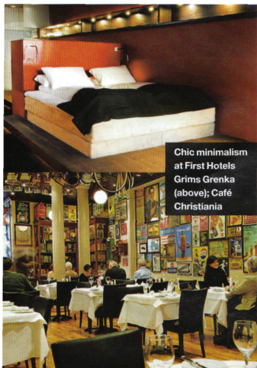
Chic minimalism at First Hotels Grims Grenka (above); Café Christiania