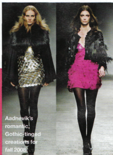
Aadnevik’s romantic, Gothic-tinged creations for fall 2008

“Donatella gave me complete trust and freedom to