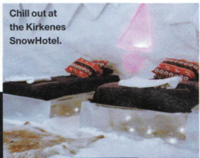
Chill out at the Kirkenes SnowHotel.

Getting there Icelandair flies from Halifax and Toronto to Oslo and Bergen via Reykjavik. □