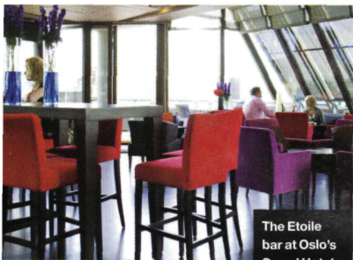
The Etoile bar at Oslo's Grand Hotel; Shopping at Trabant

Where to stay At First Hotels Grims Grenka , a new luxury design hotel, the look is minimalist, with clean lines, warm accents and lots of glass and wood. Stay in the loft suite, which boasts high-drama decor: rich scarlet walls and a tub on a stage in the middle of the room. ▷