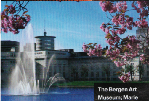
The Bergen Art Museum; Marie Antoinette glam at Feliz nightclub