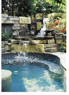
Guests of Niagara-onthe-Lake's 100 Fountain Spa can relax with a candlelit massage, or soak in the blissful outdoor hot springs.